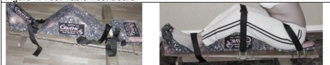
Figure 1: Test-Table-Test Board